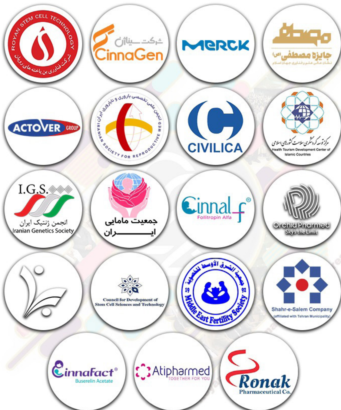
Royan International Virtual Congress (2021)